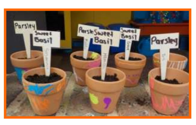
Our planting on green day