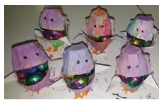
Aurora made the egg carton Easter decorations and cut out and decorated Easter Bunny's.